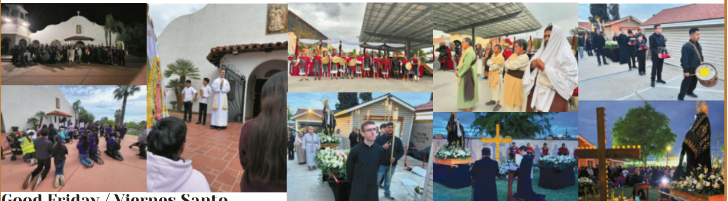
Good Friday / Viernes Santo