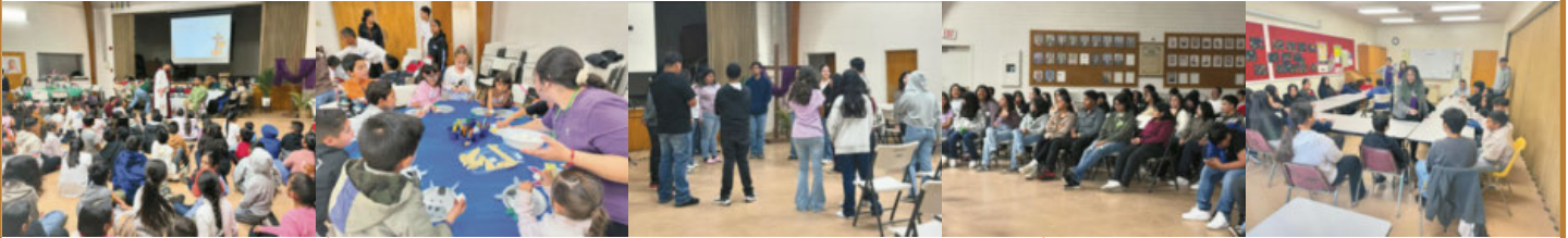
Children's Easter/ Pascua Infantil

Tuvimos una participación increíble este año en todos nuestros eventos de Semana Santa. Nos gustaría agradecer a todos los que participaron, se ofrecieron como voluntarios y/o donaron de alguna manera. Sin toda su ayuda esto no sería posible. Gracias por su continuo apoyo y por hacer que estos eventos sean posibles y exitosos para nuestras comunidades parroquiales de la Misión de San Clemente y la Iglesia de San José. Dios los bendiga a todos.