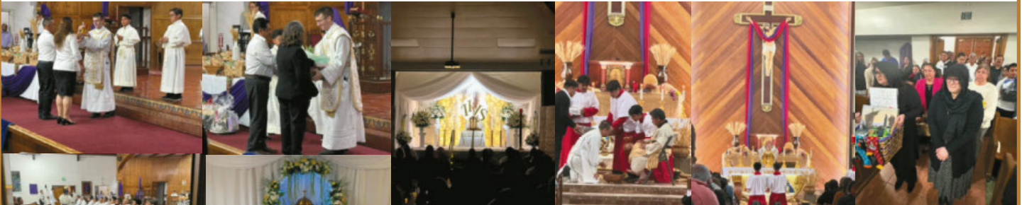
Youth Easter/ Pascua Juvenil